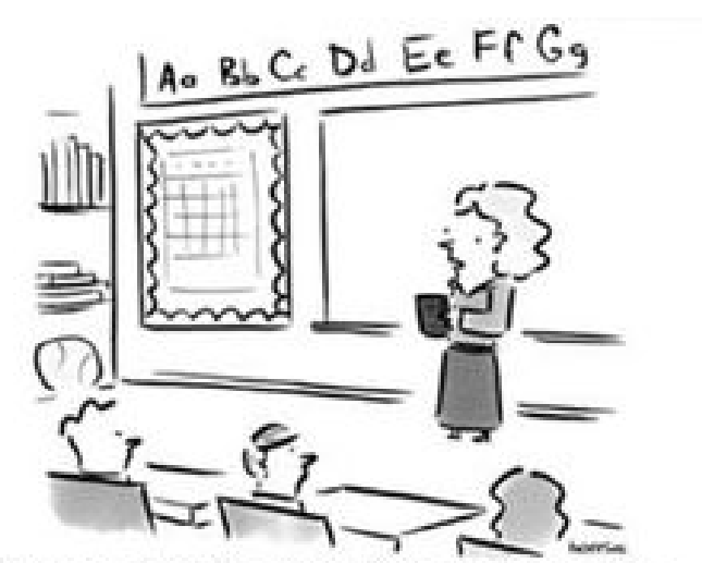
"I appreciate the text, Kate, but next time you can just raise your hand."